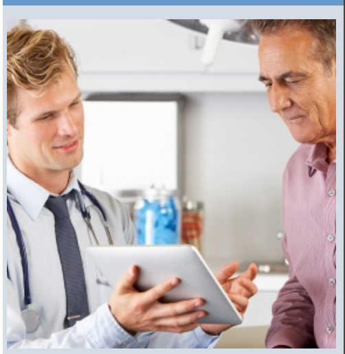
Clinics and practices currently participating in JHIE include: